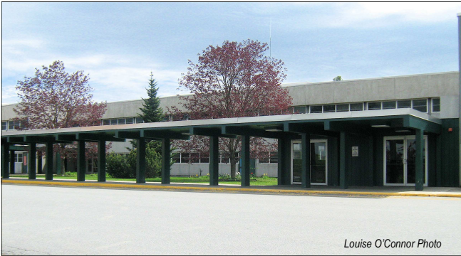
Louise O'Connor Photo